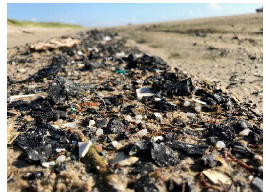
Fig 2. Nurdles in strandline

Nurdles are very light and can be blown by strong winds onto the shore, from the sea. They often get caught in the base of the grasses and rocks at the top of the beach.