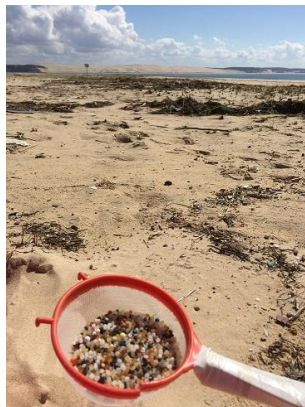
A simple sieve works wonders

Sieves of all shapes and sizes can be useful on a sandy beach.