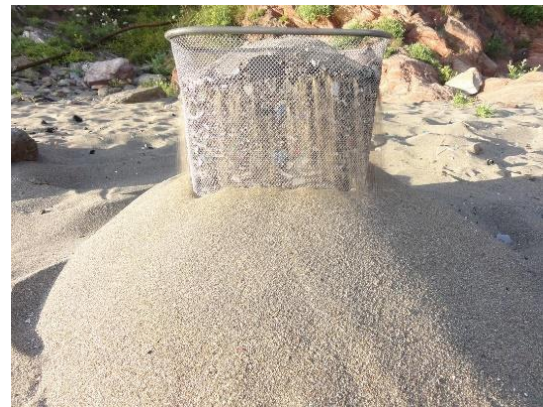
A mesh bin can be used for industrial scale removal